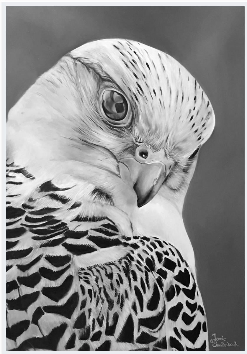
Gyrfalcon 2016 by Jennie Smalbroek. Oil on wood 60x40cm