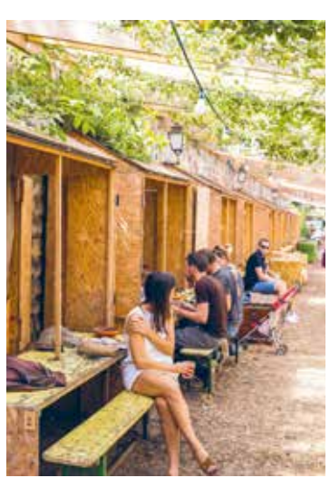
Index 188 Who made this book? 191-192