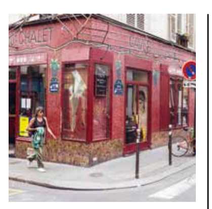
GREEN PARIS 168 OUTSIDE OF PARIS 184