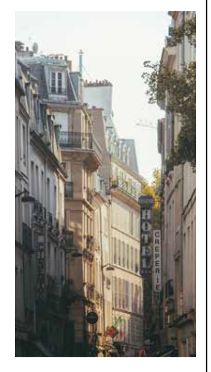
FOOD & DRINKS 98 GOING OUT 126