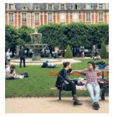
WHEN TO TRAVEL 28 LIFE IN PARIS 38