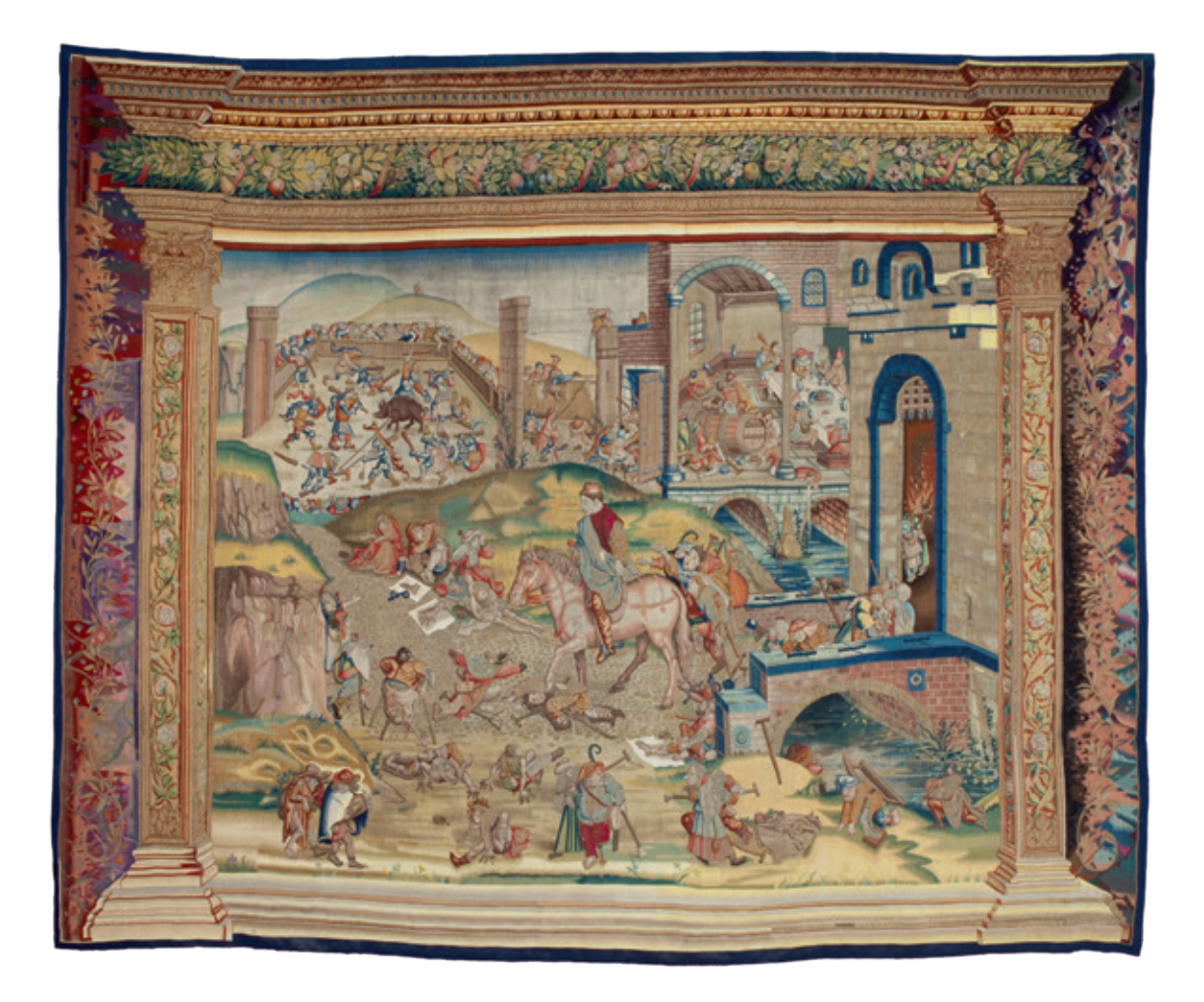
Fig. 1 Brussels workshop after Jheronimus Bosch, The Feast of Saint Martin , before 1560 Gold, silver, silk and wool, 296 x 364 cm Real Monasterio de San Lorenzo de El Escorial, inv. 1005803)

This drawing has no overarching iconographic theme. There is no clear compositional coherence between the groups. It is a Musterblatt , a sample sheet of marginal figures. The drawing was actually used as a model sheet. A tapestry woven in Brussels, of which the oldest documented edition dates from before 1542, shows the figure with the harp in the foreground in reverse (fig. 1).<sup>2</sup>