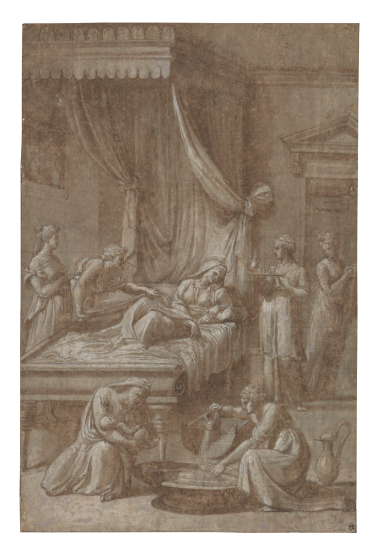
Fig. 10 Giovanni Francesco Penni, The Birth of Mary Pen and brown ink, brown wash, heightened with white gouache, squared for transfer in black chalk, 320 x 211 mm Brussels, KBR, inv. S.IV 40016