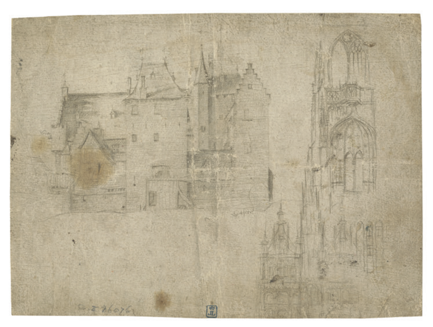
Anonymous, Sheet from a Sketchbook with an Unidentified Castle and Late-Gothic Architectural Details, c. 1520