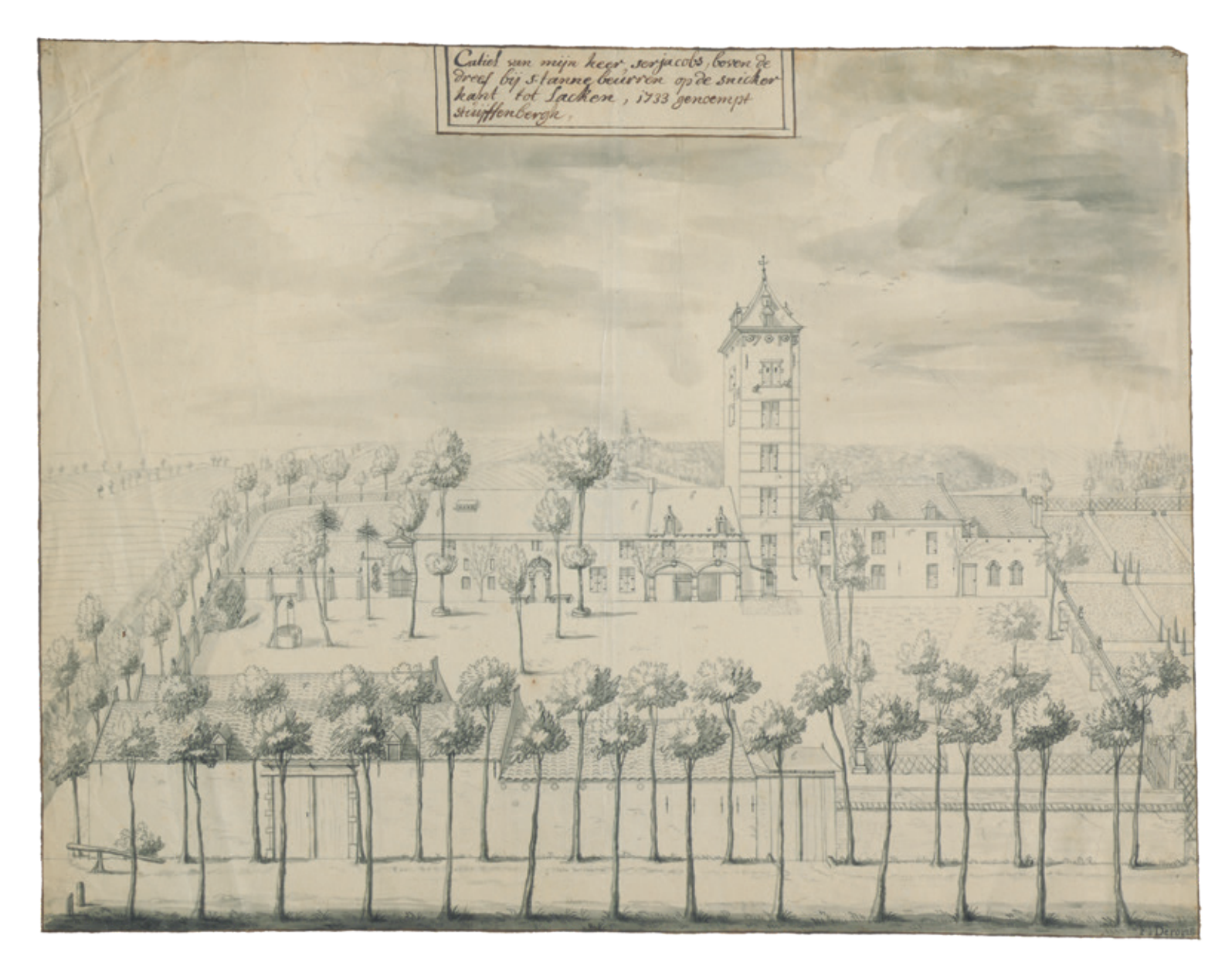
Fig. 8 Ferdinand-Joseph Derons, View of the Manor House of Stuyvenberg in Laken near Brussels, 1733 Pen and grey ink, grey wash and graphite, 309 x 399 mm Brussels, KBR, inv. S.III 5977