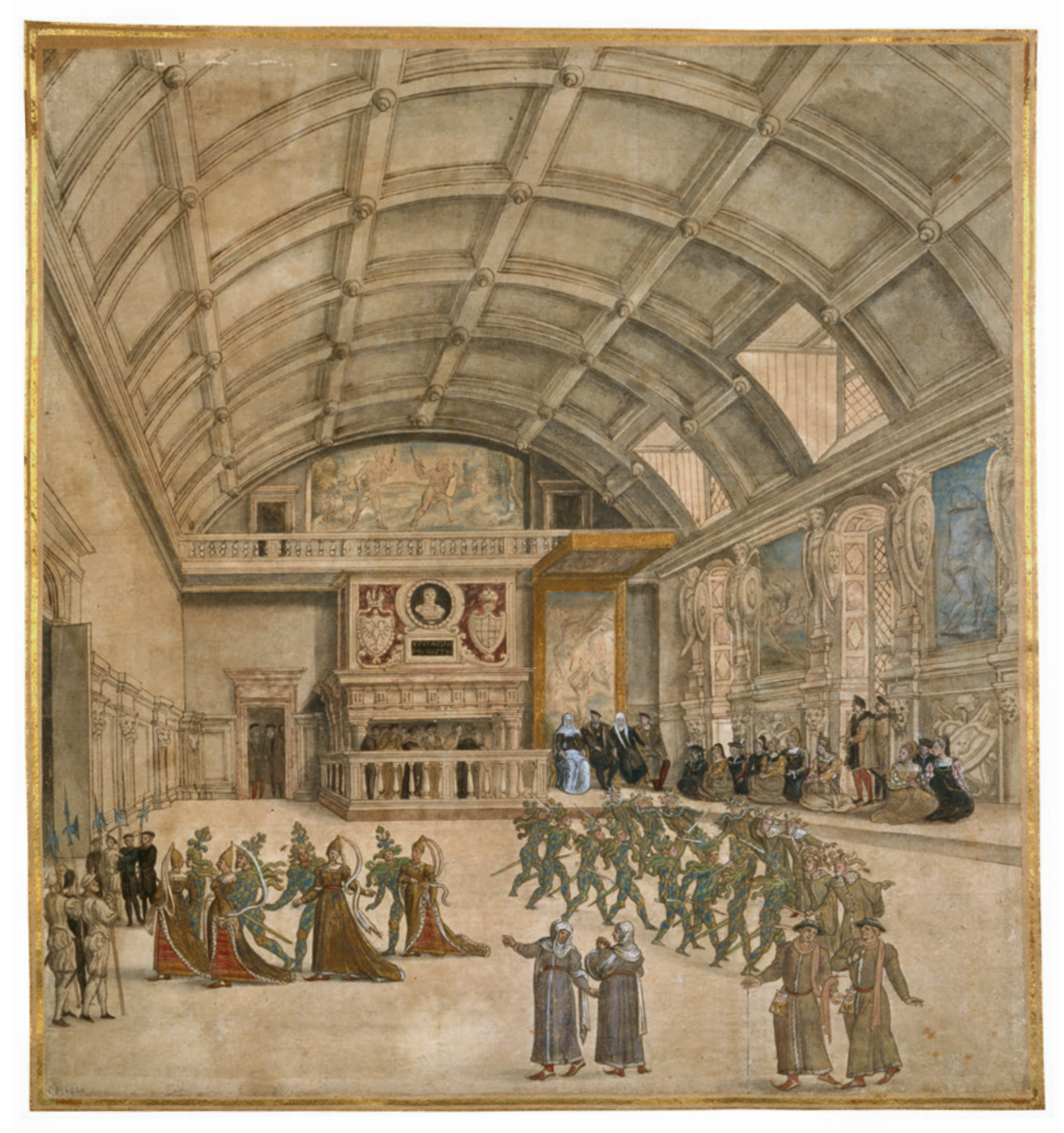
Anonymous, The Great Hall of Binche Palace, c. 1549