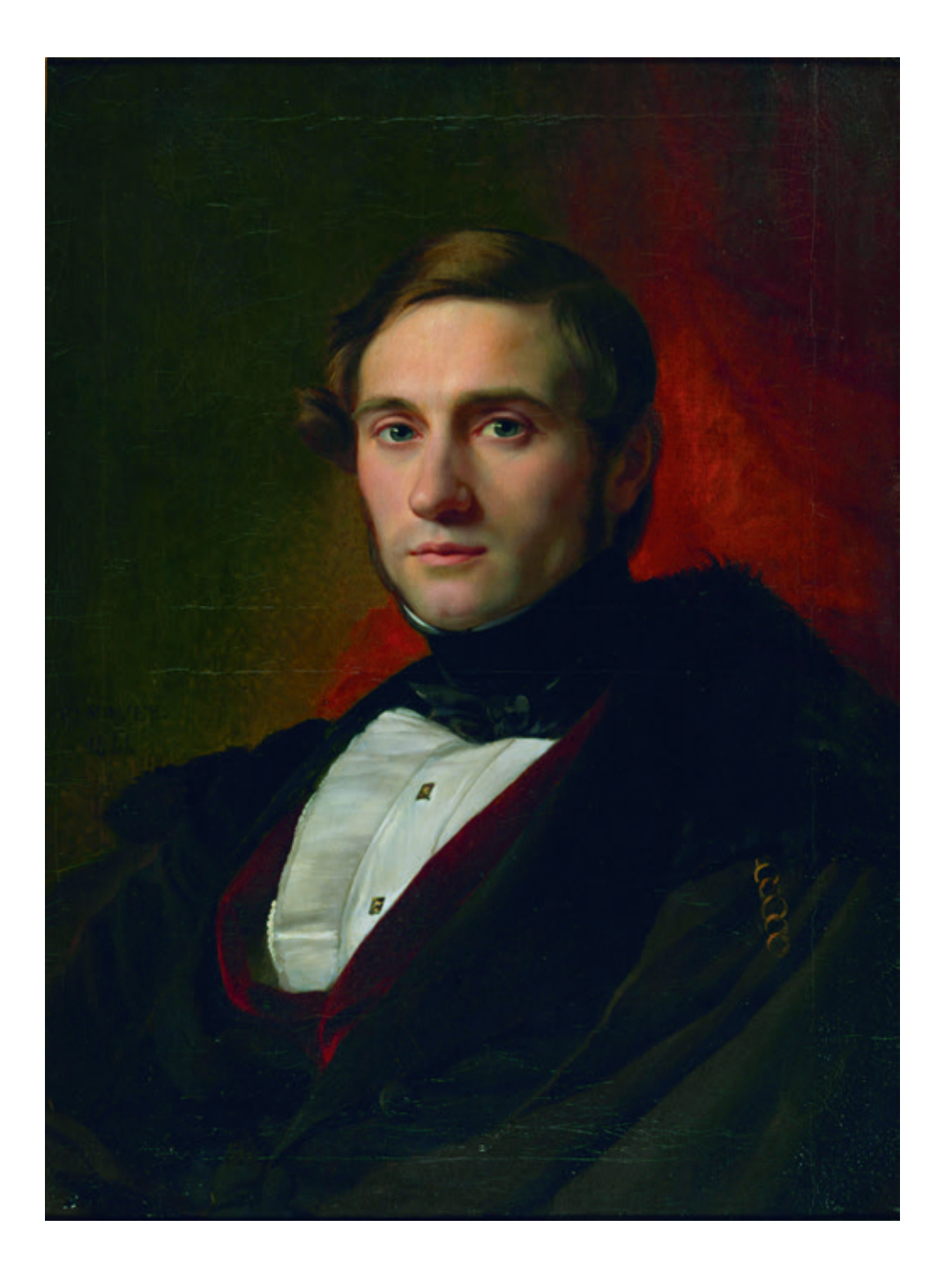
Fig. 2 François-Joseph Navez, Portrait of Louis Alvin, 1841 Oil on canvas, 69.5 x 51.3 cm Brussels, Royal Museums of Fine Arts of Belgium, inv. 10130