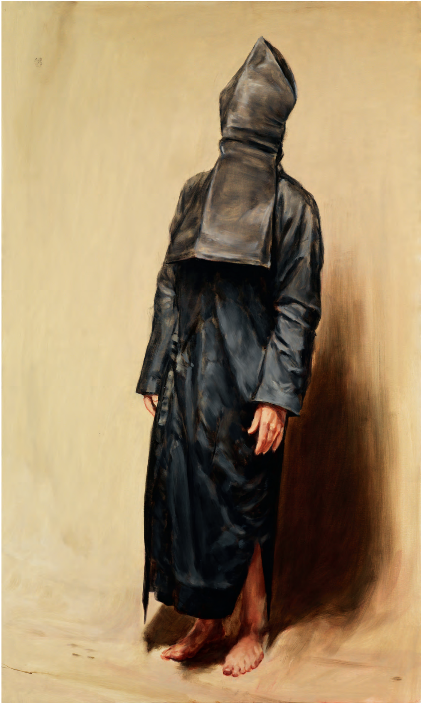
Black Mould, 2014, oil on canvas, 200 × 120 cm