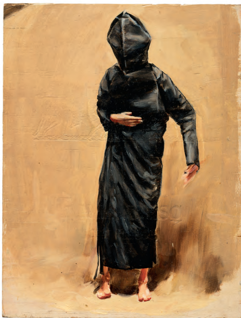
Black Mould / Pogo, 2015 (part of a series of 16), oil on wood, 32.3 × 24.7 cm