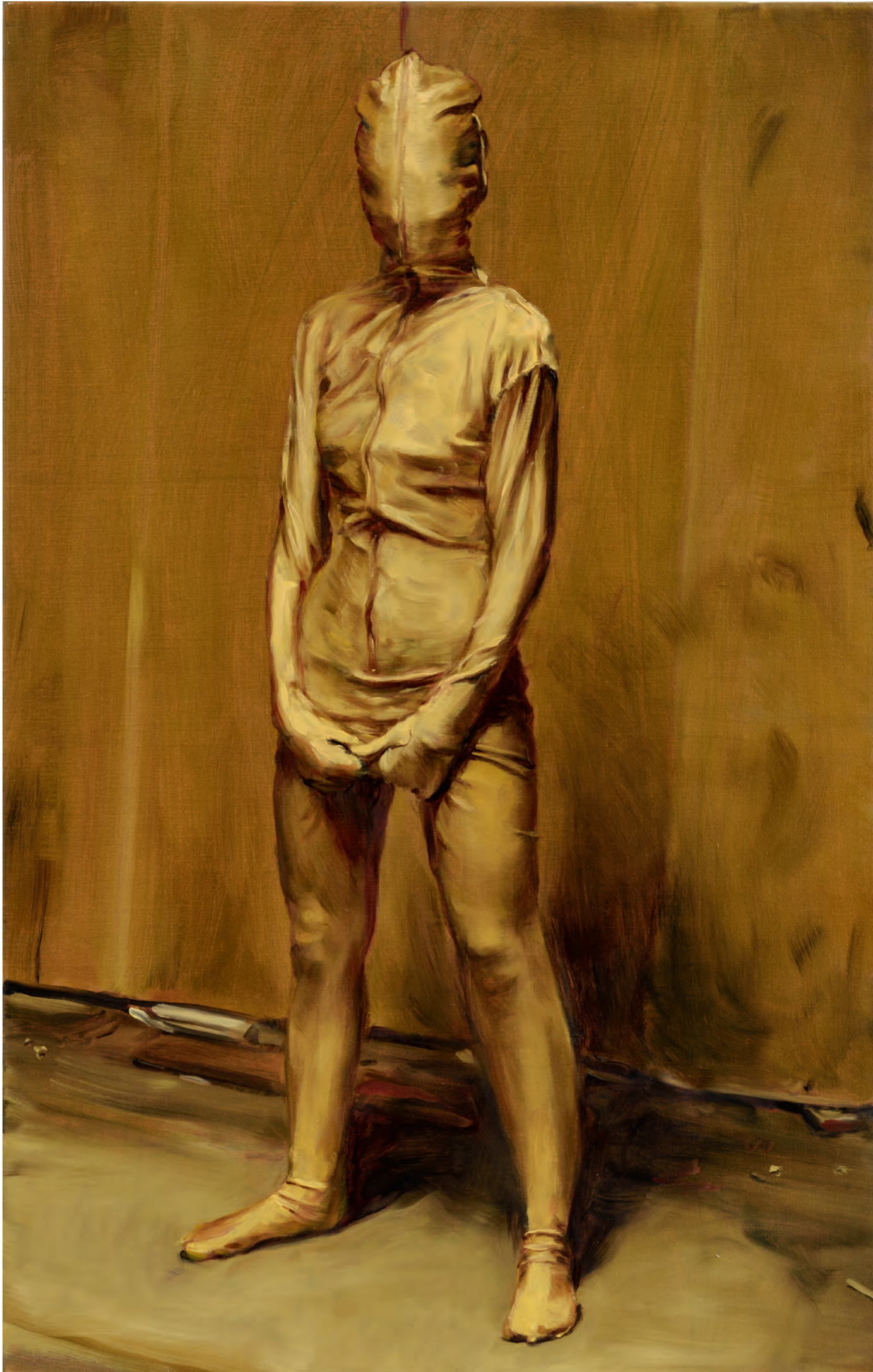
The Promise IV, 2016, oil on canvas, 110×70.2 cm