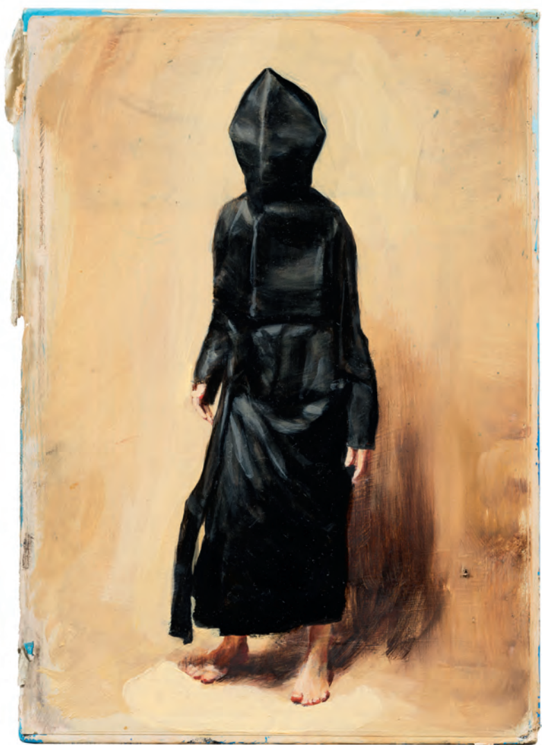
Black Mould / Pogo, 2015 (part of a series of 16), oil on cardboard, 32.4 × 23 cm