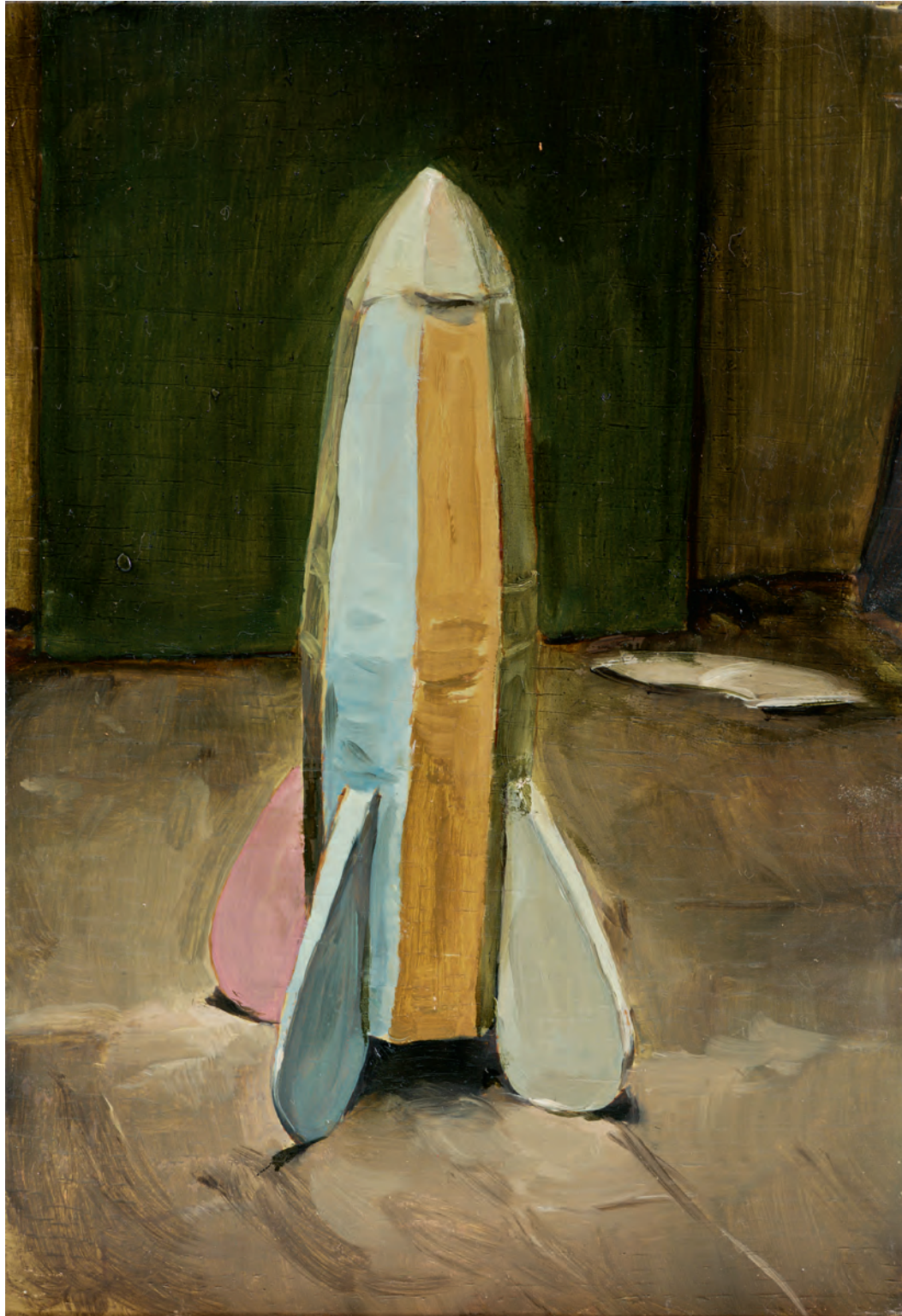
Merry Missile, 2020, oil on wooden panel, 21.5 × 14.8 cm