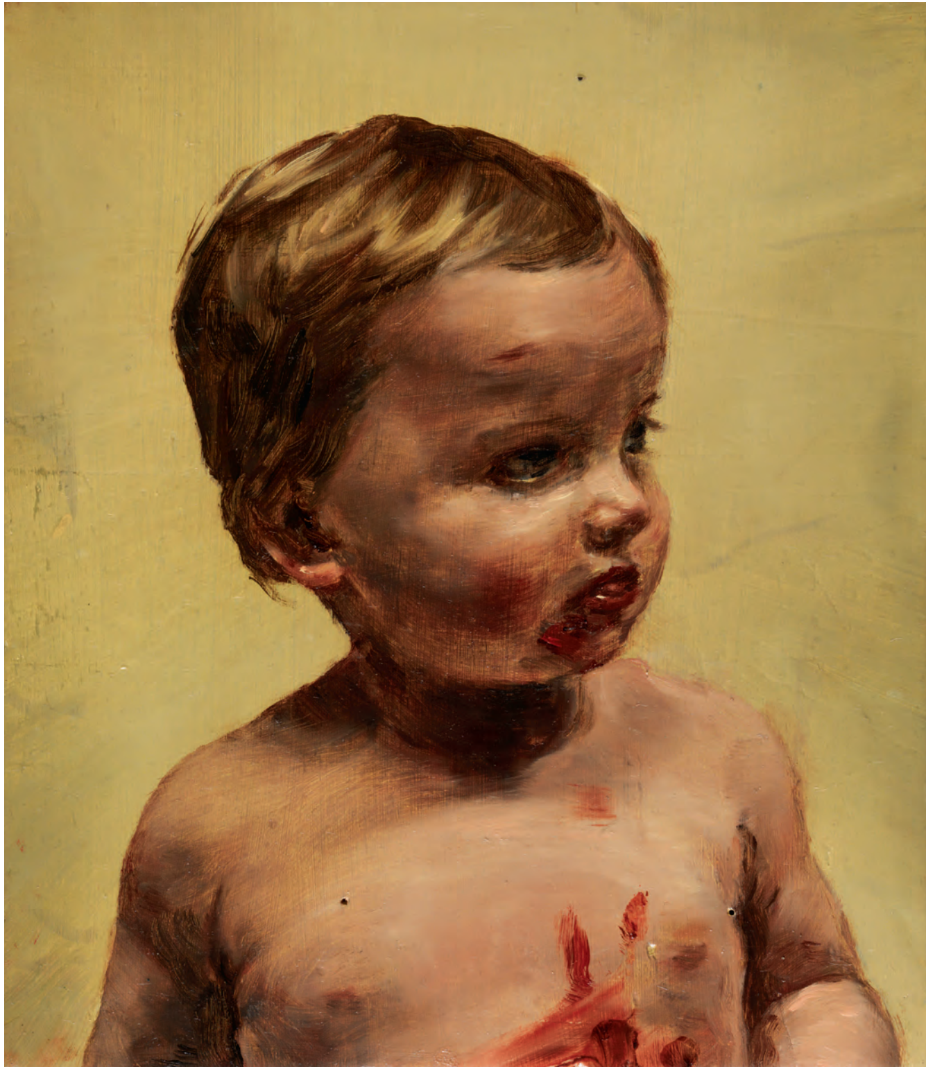
Fire from the Sun, 2017, oil on wooden panel, 29.1 × 25.1 cm