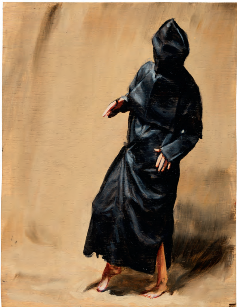
Black Mould / Pogo, 2015 (part of a series of 16), oil on wood, 29.8 × 22.9 cm