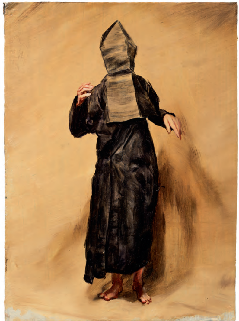
Black Mould / Pogo, 2015 (part of a series of 16), oil on wood, 30.2 × 22 cm