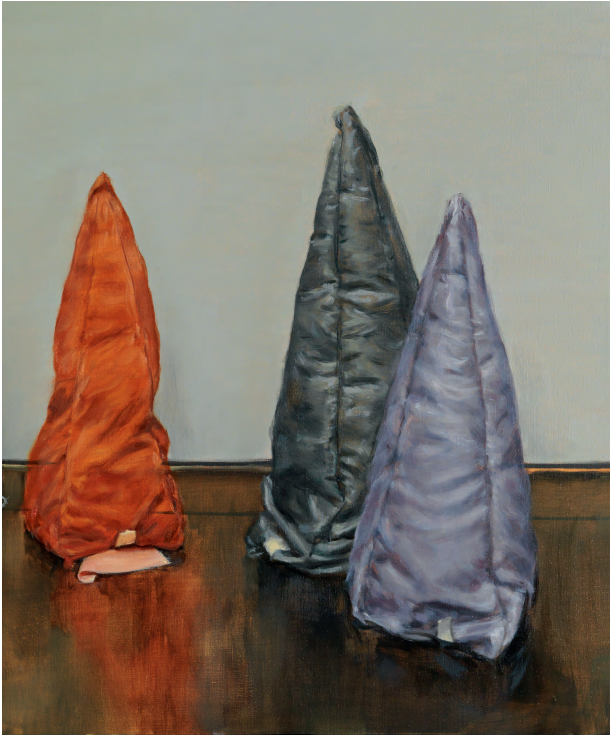
Coloured Cones, 2019, oil on canvas, 88 × 120 cm