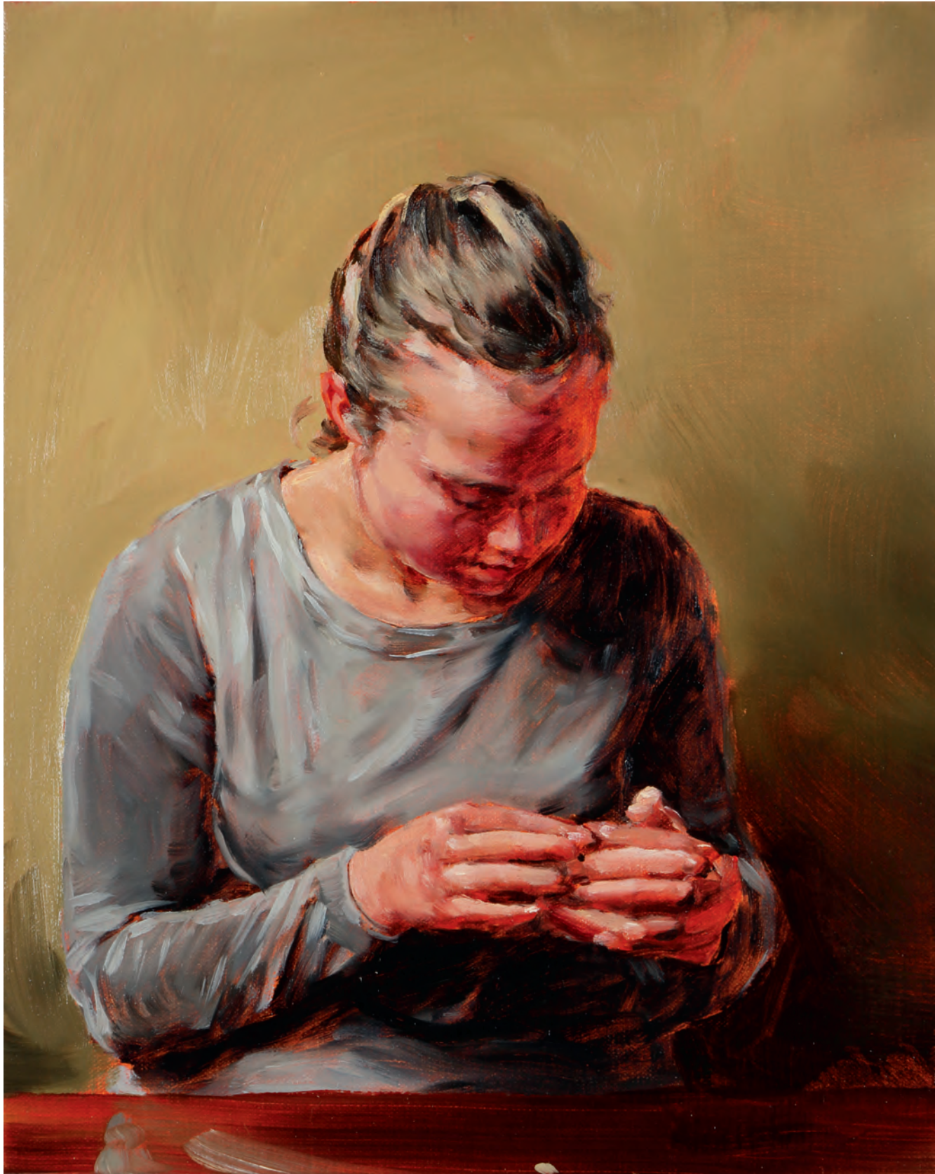
Girl with Hands 3, 2013, oil on canvas, 32.5×26 cm