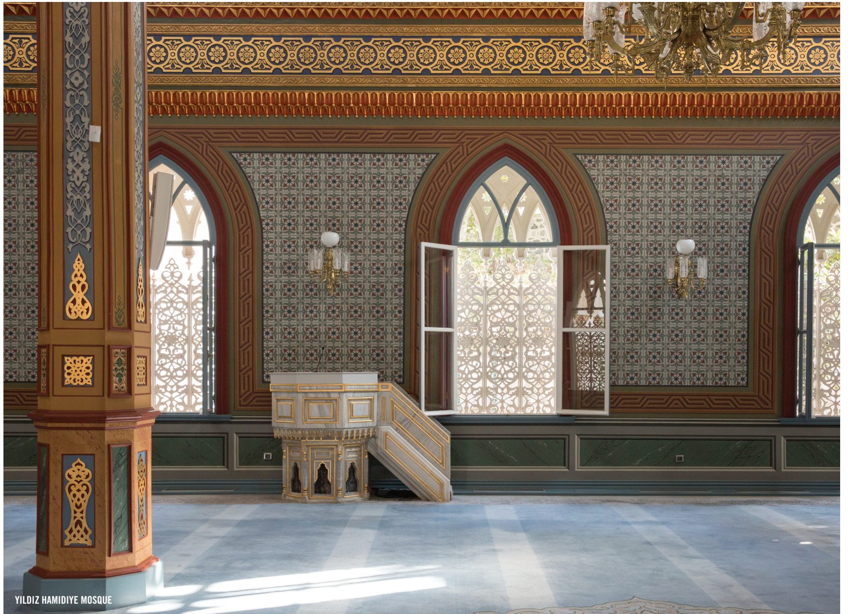
YILDIZ HAMIDIYE MOSQUE