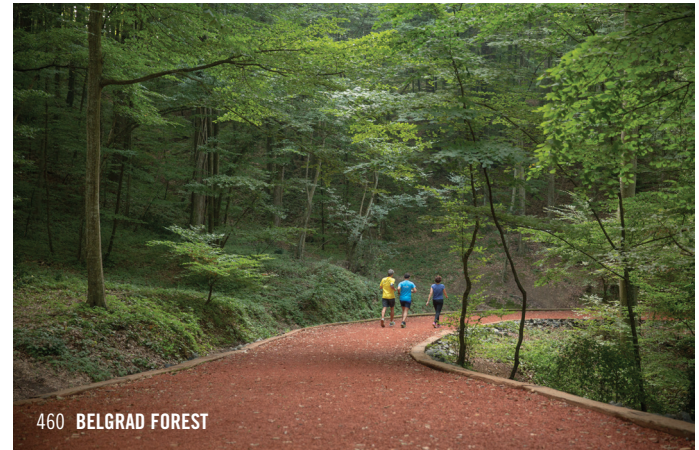
460 BELGRAD FOREST

Once a village that housed the thousands of Serbs who were brought to Istanbul after the Ottoman Siege of Belgrade in 1521, the Belgrad Forest is now a verdant paradise of deciduous trees with hidden historic ruins. It also has a more than 6 km running and walking path through nature.