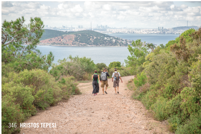
346 HRISTOS TEPESI

A sense of penetrating serenity is inevitable when you reach the top of Burgazada overlooking the expanse of the sea and horizon. The Hristos Tepesi (Christ Hill) was once home to a Byzantine monastery, but nowadays only ruins and a small 19th-century church remain, as well as the fascinating Greek cemetery amid the pines.