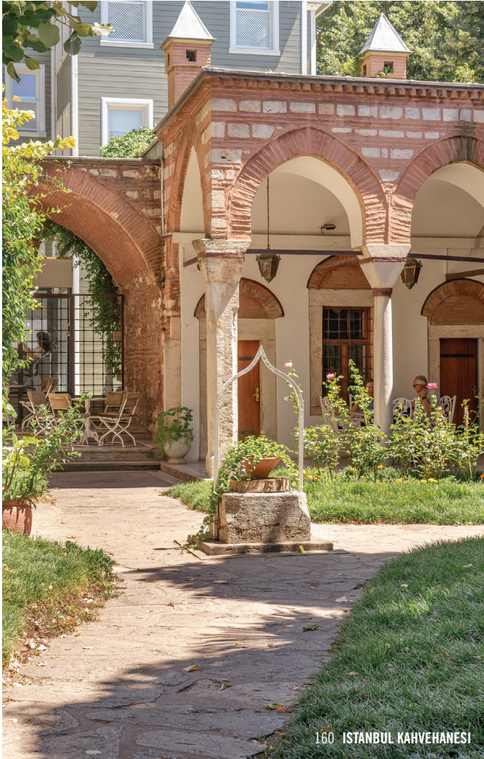
160 ISTANBUL KAHVEHANESİ