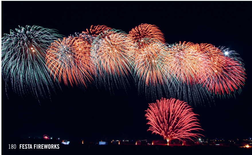
180 FESTA FIREWORKS

The word boċċi means marbles, but in Malta this refers to an old street game that is played with wooden balls in various sizes. This is a game for all seasons, and there is also a national league with different village clubs. In summer boċċi is a popular pastime, to be played with neighbours, usually in the evening and mostly near the sea. There are a number of courts all around the islands, where you can see people practicing and playing this game.