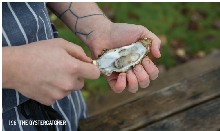
196 THE OYSTERCATCHER