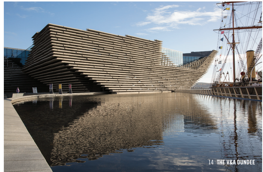
14 THE V&A DUNDEE

This truly unique and outstanding building makes quite the impression on the Dundee skyline. Designed by Japanese architect Kengo Kuma, its form is said to be inspired by the cliffs of the North East and is quite the structure to ponder over. It's the first ever museum in Scotland dedicated to design and showcases some of the most influential and inspiring collections of international and Scottish design, both physically and virtually and certainly is a bold statement to begin with. Ten years in the making, it's a grand addition to the UNESCO city of design.