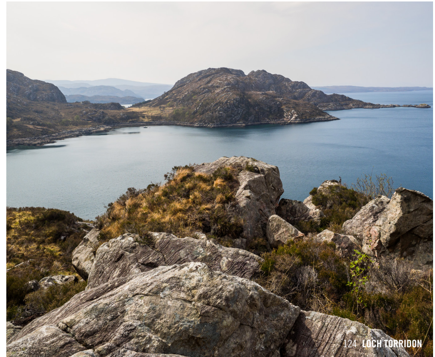
124 LOCH TORRIDON

Loch Torridon is a vast and incredible landscape that takes in a few villages and townships on its 24-kilometre stretch. The Loch is a sea loch, and surrounded by magnificent Munros that arise from the sea, making this place a mecca for sea kayakers, hillwalkers and mountain bikers. Not to mention the famous Torridon sandstone that also attracts climbers. The bounty from the loch is also to be desired, with it producing top-quality Scottish seafood. One of the most beautiful spots in Scotland, it has plenty to offer and explore.