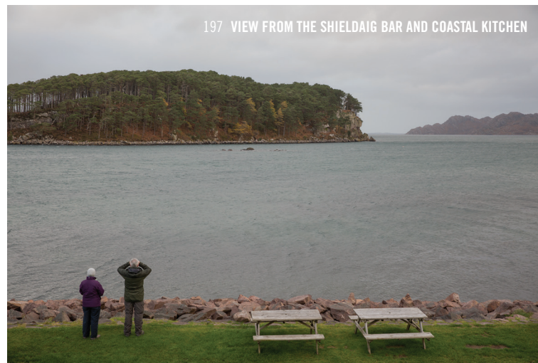
197 VIEW FROM THE SHIELDAIG BAR AND COASTAL KITCHEN

The outside seating and upstairs deck provide an amazing setting to watch the world go by in one of Scotland's most scenic settings on Loch Torridon. Specialising in local seafood and wood-fired pizza, this bar is a perfect stop-off if you are in the area. Local An Teallach Brewery on tap for ale lovers and not a bad selection for a wee bar. Get the craic on Saturday nights as they usually have a folk session on the go, which is worth popping your head in the door for. Booking advised at the height of the season.