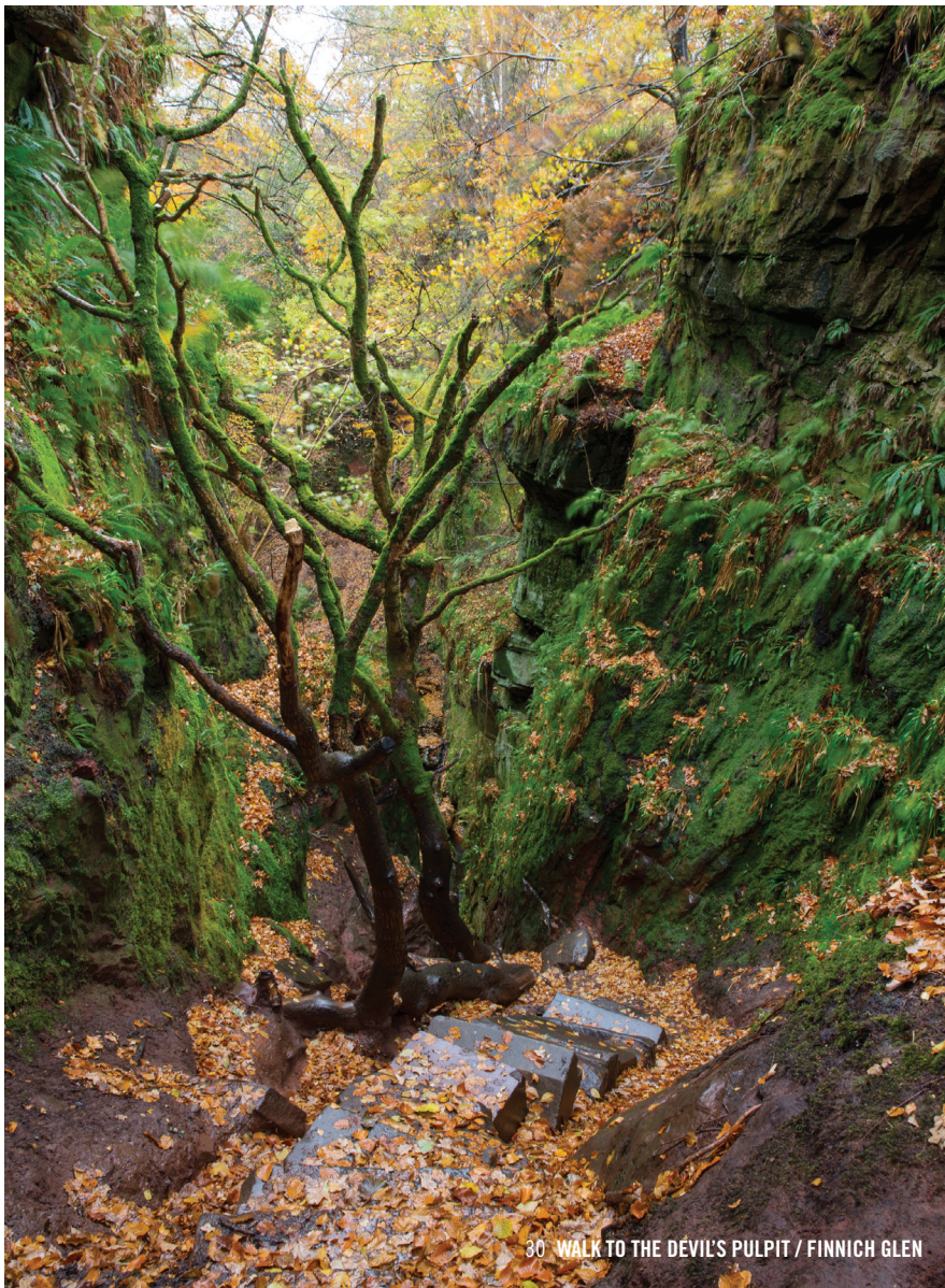
30 WALK TO THE DEVIL'S PULPIT / FINNICH GLEN