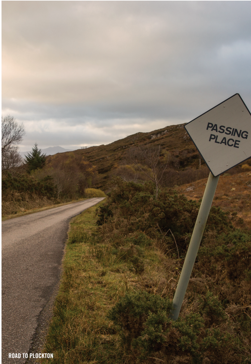
ROAD TO PLOCKTON