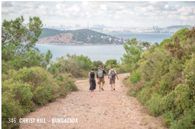
346 CHRIST HILL – BURGAZADA

A sense of penetrating serenity is inevitable when you reach the top of Burgazada overlooking the expanse of the sea and horizon. The Hristos Tepesi (Christ Hill) was once home to a Byzantine monastery, but nowadays only ruins and a small 19th-century church remain, as well as the fascinating Greek cemetery amid the pines.