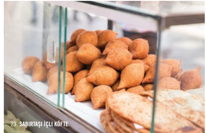
23 SABIRTAŞI İÇLİ KÖFTE

This tiny vendor in the often daunting labyrinthine streets of the Grand Bazaar serves some of the best döner in town. Catch one of the few seats and order a dürüm (wrap with döner meat) and ayran (yoghurt drink) and enjoy your fantastic meal while shoppers from all over the world rush by on their consumerist journeys.