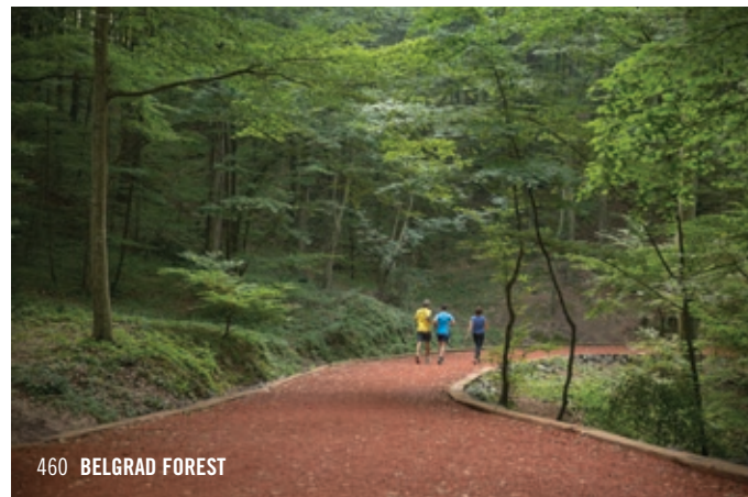
460 BELGRAD FOREST

Once a village that housed the thousands of Serbs who were brought to Istanbul after the Ottoman Siege of Belgrade in 1521, the Belgrad Forest is now a verdant paradise of deciduous trees with hidden historic ruins. It also has a more than 6 km running and walking path through nature.