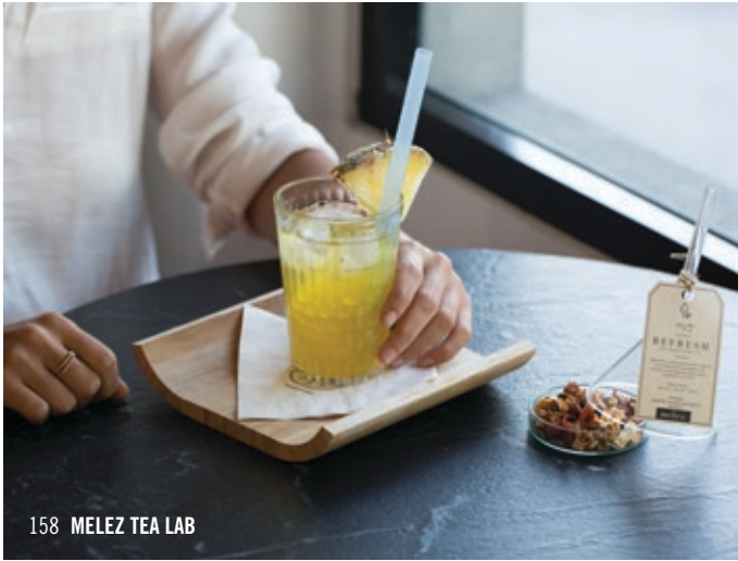
158 MELEZ TEA LAB