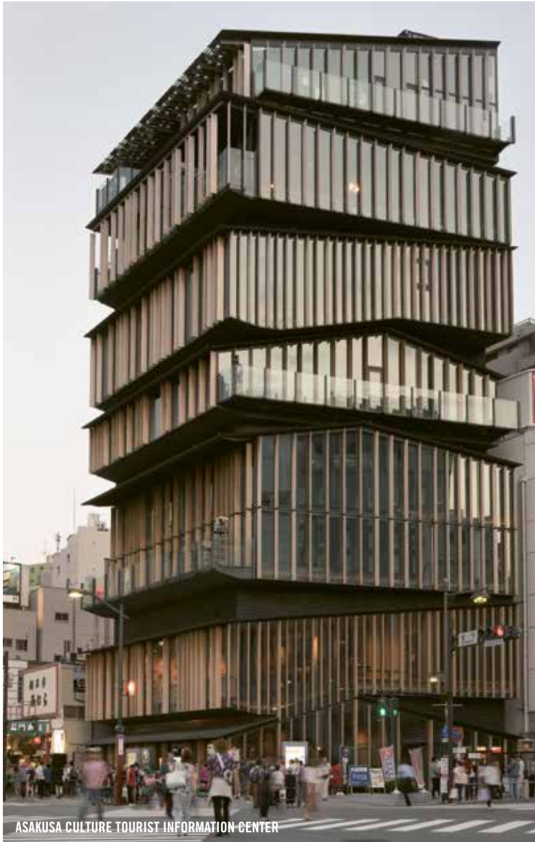
ASAKUSA CULTURE TOURIST INFORMATION CENTER