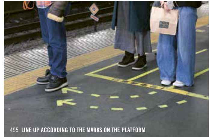
495 LINE UP ACCORDING TO THE MARKS ON THE PLATFORM

When you look at a platform, there are marks that tell you where the doors are. In other words, they tell you where you can get on the train. Usually, these marks make passengers queue in two lines. Sometimes, they also indicate the area where you can wait for the next train.