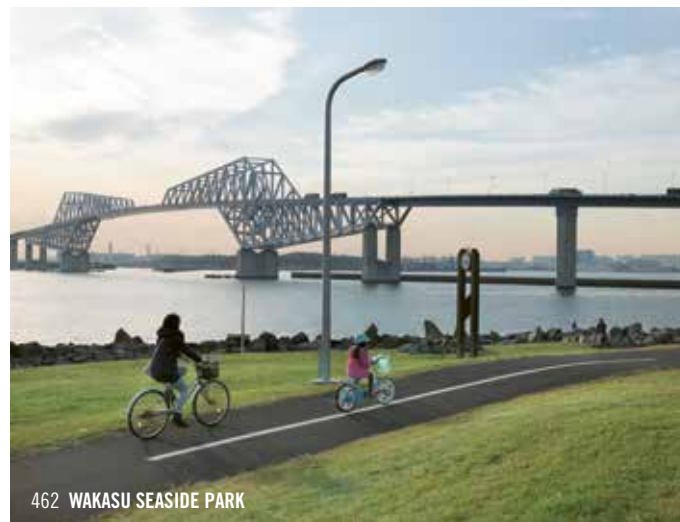
462 WAKASU SEASIDE PARK

This park has a 14-kilometre cycling trail, and three 'cycling centres' where you can rent a bike. You can choose from 18 to 26-inches or rent a tandem bike. And naturally, you can also bring your own. This course is for cyclists only, no pedestrians allowed.