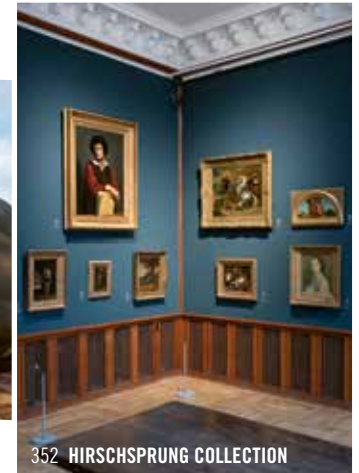
352 HIRSCHSPRUNG COLLECTION