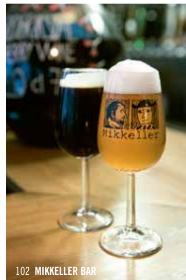
102 MIKKELLER BAR

Since 2012, the team behind the microbrewery Ølsnedkeren (the name means 'the beer carpenter') have been growing a strong local following. Tip: enjoy large beers for the price of small ones during Monday happy hour.