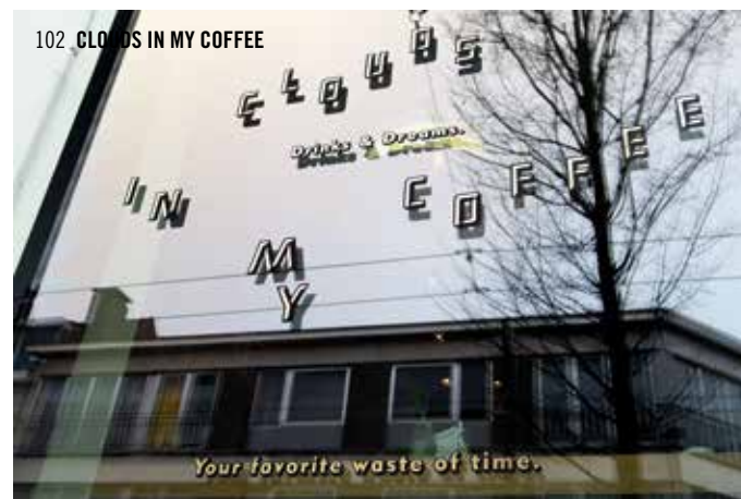
102 CLOUDS IN MY COFFEE

Students from the Sint-Lucas art academy fill this bright, buzzing coffee bar on weekday mornings. It is a relaxed place with big windows, white wooden chairs and lazy background jazz. The cakes they serve here come from Julie's House.