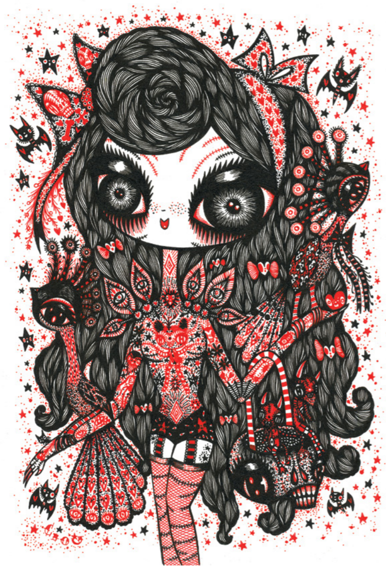
46. Lady Circus 2011, 20 x 15 CM