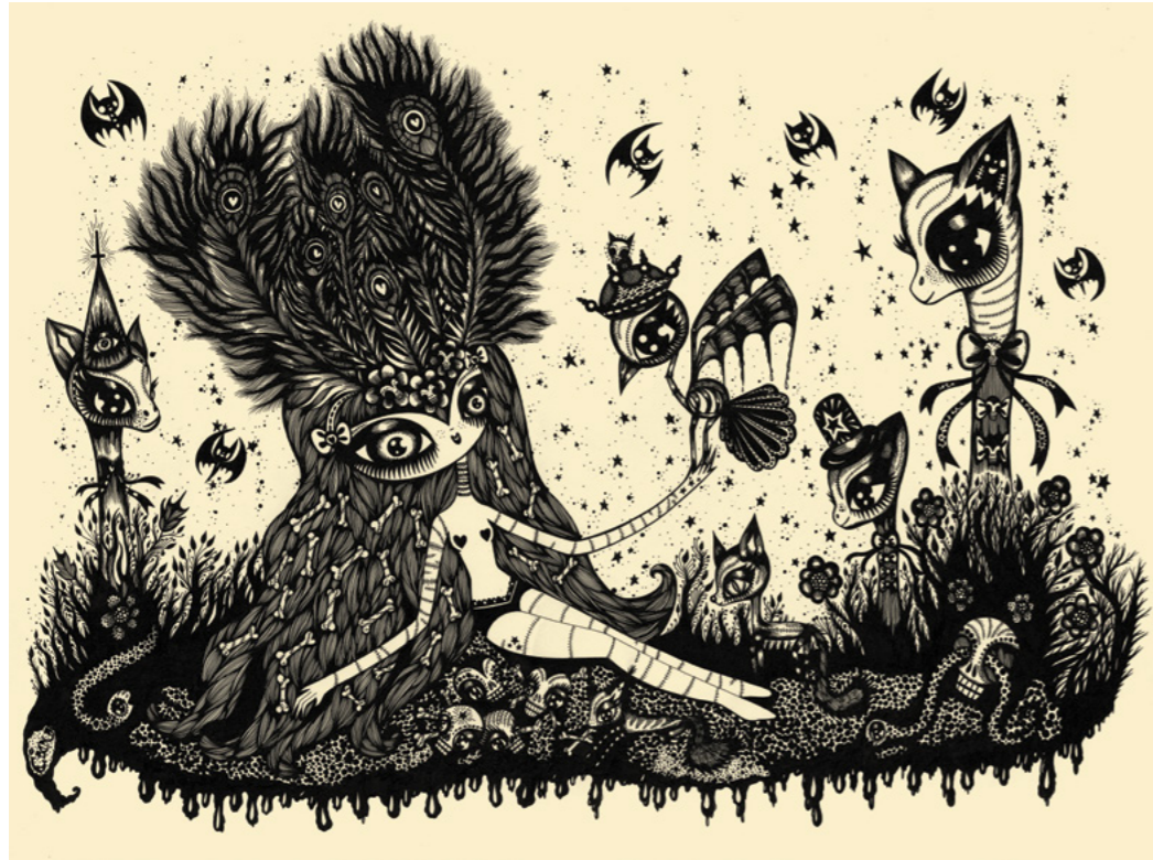
54. Nymph And The Spirit Of The Sky 2009, 40 X 30 CM