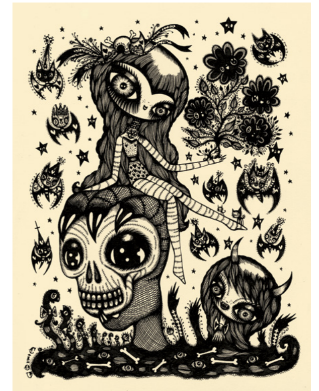
Skull 2009, 24 X 18 CM