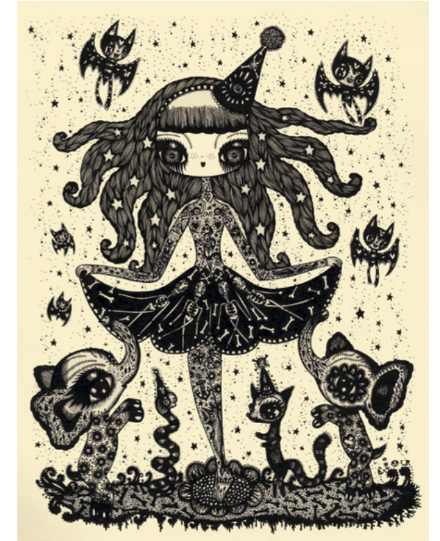
Pināta 2010, 40 X 30 CM