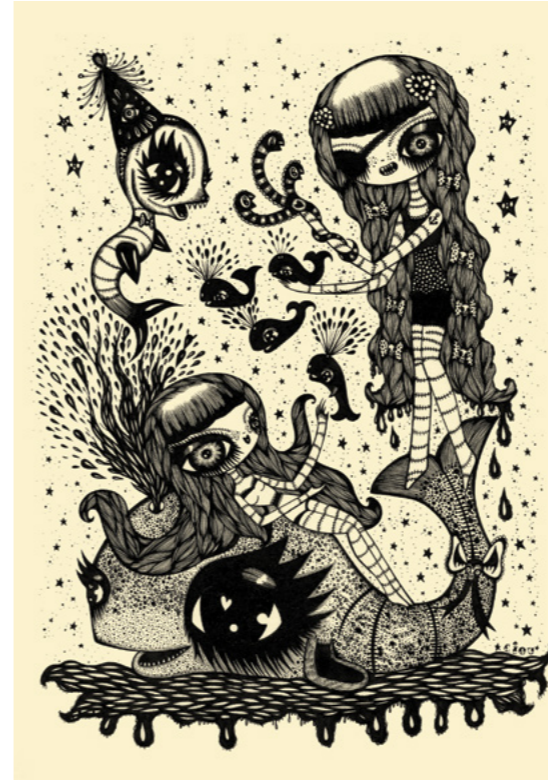
Pirates And The Circus Of The Sea 2010, 20 X 15 CM