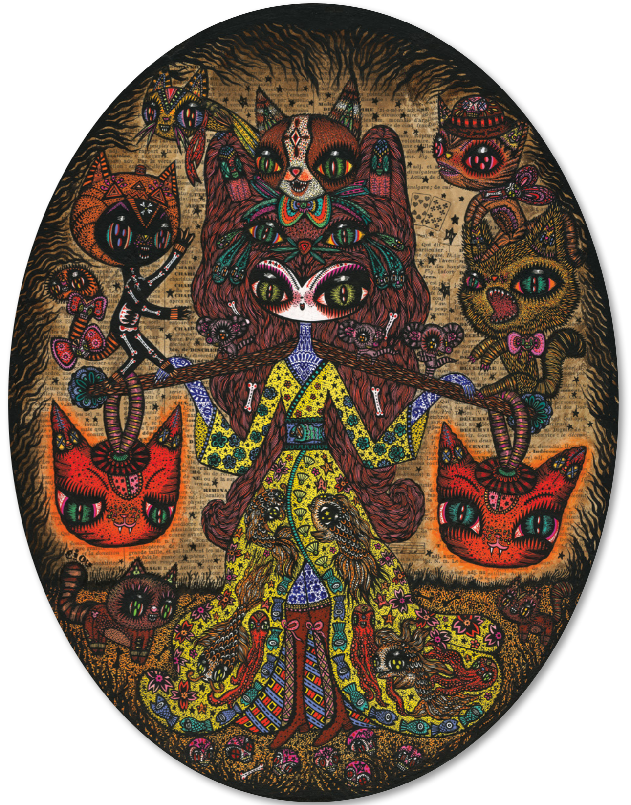
20. Cat's Empire 2013, 28 x 24 cm