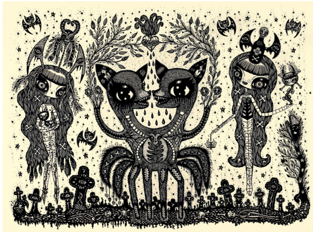
When We Are Together 2010, 40 X 30 CM