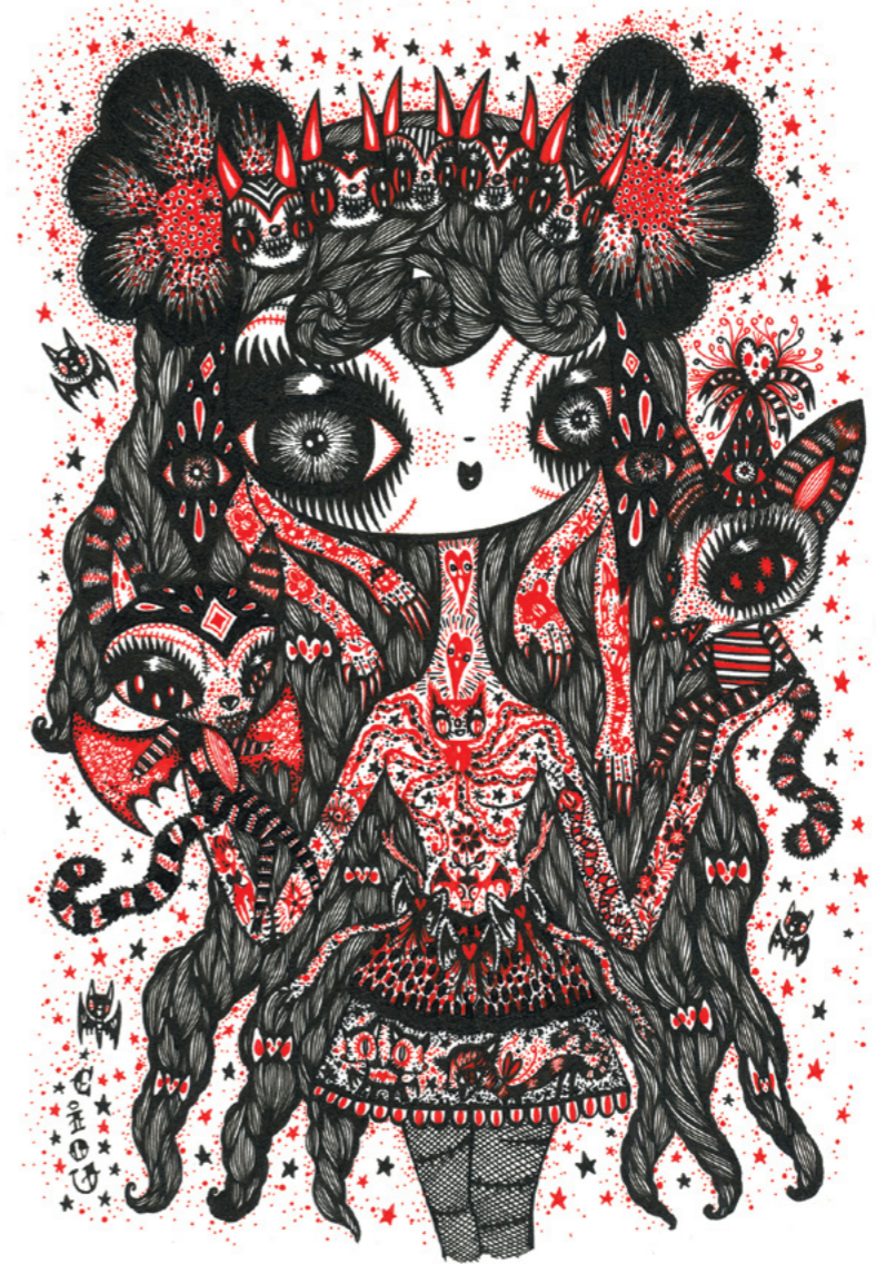
Evil Beauty 2011, 20 x 15 CM