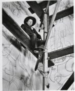
Ameymeon Diego Rivera in front of the mural in the Palacio Nacional in 1929, color on gelatin, 17.2 x 12.2 cm FMA Collection, Museo Museo Diego Rivera, Mexico