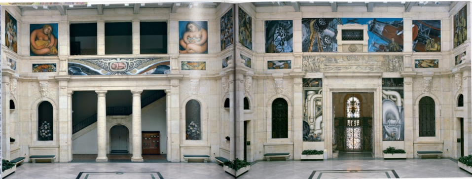
The industry of Detroit East wall 1912, fresco, 27 m 2 Detroit Institute of Arts