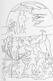
B. From the conquest to 1847 1929-1932 Total area 146.29 m 2