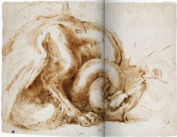
175 Michelangelo (partly), Study of a winged monster, with sketches of heads underneath. c. 1525 (?) Pen over a black chalk outline, red chalk, 254 x 336 mm Oxford, Ashmolean Museum, P. 323r