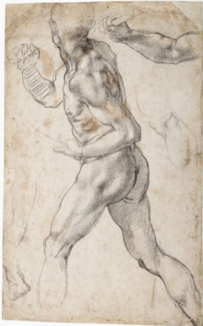
39 Study of a man running and looking into the background (for the Battle of Cascina ), studies of an arm, leg and foot, 1504–1506 Black chalk with white heightening, 404 x 258 mm, Haarlem, Teylers Museum, A19r