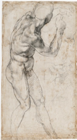
40 Figure study of a man pointing into the background (for the Battle of Cascina ), 1504–1506 Black chalk, 404 x 225 mm, Haarlem, Teylers Museum, A18r