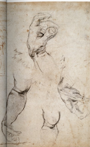
52 Compositional sketch for the Sistine Ceiling, and hand and arm studies, c. 1508 Pen over metal point and chalk, 275 x 386 mm, London, British Museum, 1859-6-25-567r