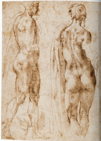
17 Five studies of nudes and drapery, c. 1501/04 Pen, 263 x 387 mm, Chantilly, Musée Condé, 29r