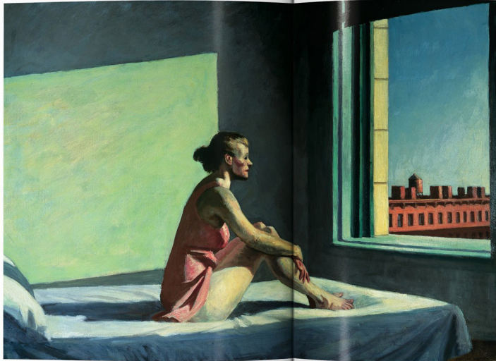
Morning Sun, 1932 Oil on canvas, 75.4 x 101.9 cm (28 x 40 in.) Columbus, Ohio, Columbus Museum of Art Museum Purchase: Howald Fund