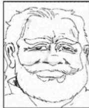
Sir Toby Belch