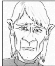
Sir Andrew Aguecheek