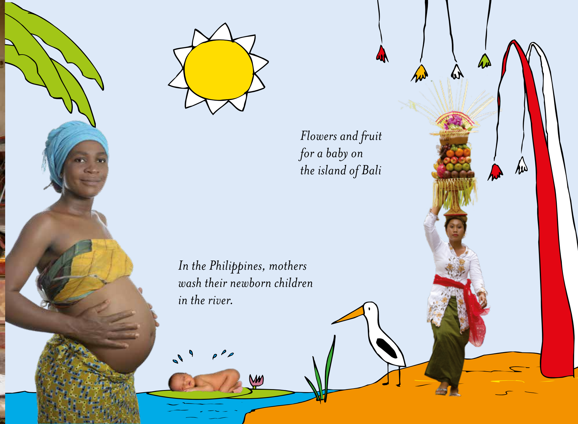
Flowers and fruit for a baby on the island of Bali